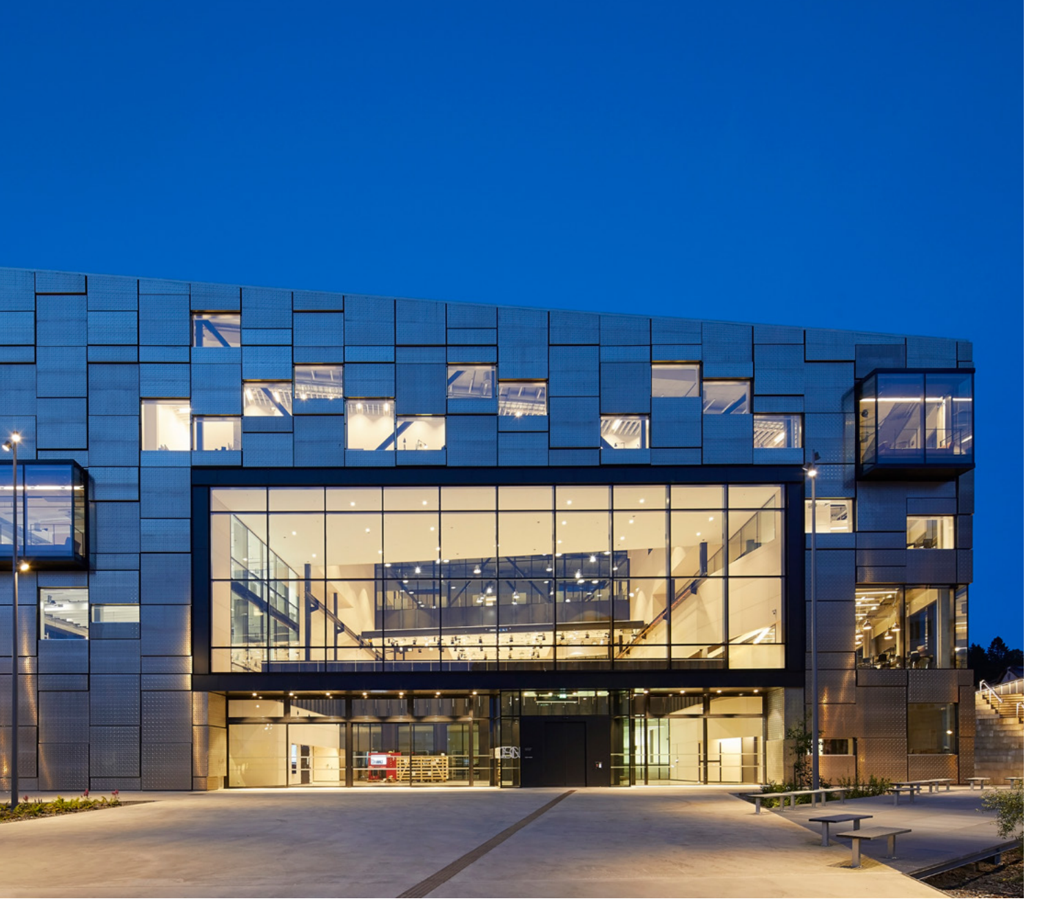
Faculty of Fine Art, Music and Design (KMD)